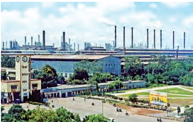
Bhilai Steel Plant